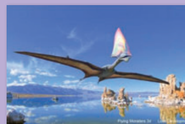
Anthony Geffen's latest 3D production Flying Monsters , showing on Sky 3D Christmas 2010

The Festival Trade Show also entered the realm of 3D with Major Sponsor and exhibitor, Panasonic, showcasing the world's first integrated twin-lens 3D camcorder for professional use, at its UK premiere – providing Festival delegates with a unique hands-on opportunity to test it out.