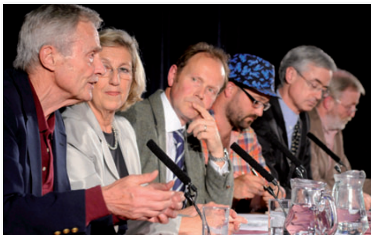
We ♥ Biodiversity, Sir Peter Scott Lecture Panellists

The debate discussed our detachment from nature, with the panellists unanimously agreeing that we must use positive messages about the wonders of nature to increase people's awareness, understanding and connection to the natural world.