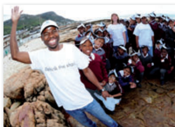
Save Our Sharks, winner of the Campaign Panda Award

Members of the public were also able to join delegates at the prestigious keynote Sir Peter Scott Lecture on Tuesday 12 October.