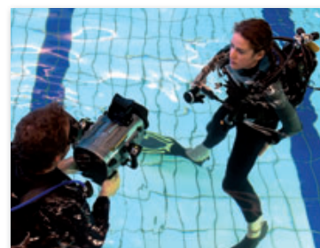
An underwater workshop

Underwater workshops were another popular choice, with some of the top names in the business hosting the sessions, including distinguished cameraman Doug Allan. Delegates also had a treasure trove of state-of-the-art equipment to try out such as the latest 3D cameras and housings.