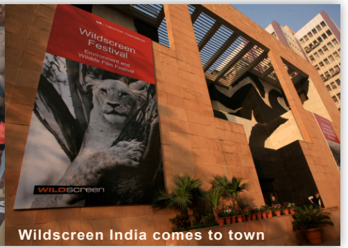
Wildscreen India comes to town