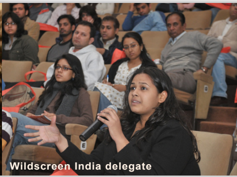
Wildscreen India delegate