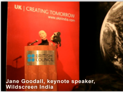
Jane Goodall, keynote speaker, Wildscreen India