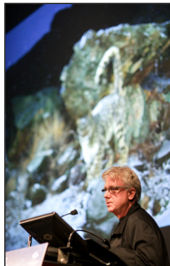
Steve Winter (USA)