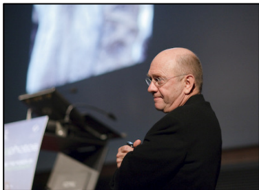
Jim Brandenburg (USA)

As in previous years the programme was a combination of presentations, discussion and debate, chaired by Chris Packham. Sessions ranged from story-telling and conservation photography, to the more practical – publication and photo techniques (from time-lapse and trip-wires to wide-angle and macro). Delegates included students and keen amateurs as well as widely published and acclaimed professionals and industry experts.